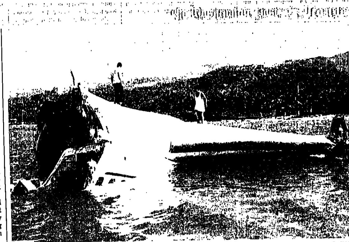
Wreckage from the Ethiopian airliner lies in a lagoon off the Comoros